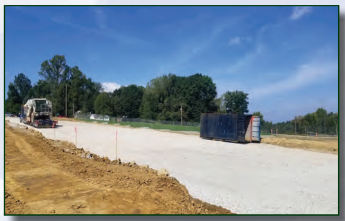
Photo above: Start of the roadway extension for Huckleberry, looking west to Frank Avenue from the middle of the new roadway.