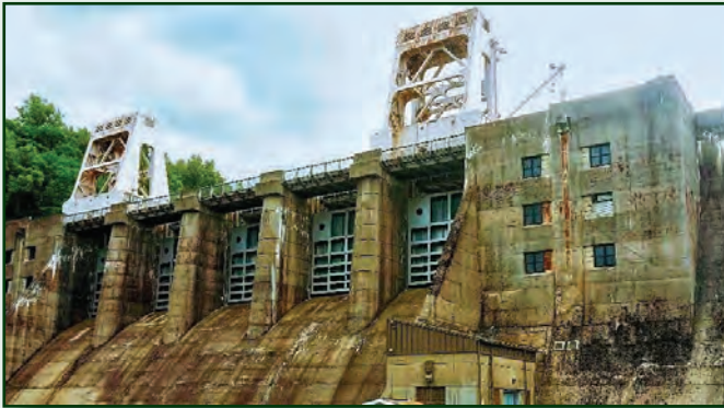
Photo shown above: Loyalhanna Lake Dam in Westmoreland County, Pennsylvania

Morris Knowles & Associates, Inc. was hired by the U.S. Army Corps of Engineers, Pittsburgh District to provide surveying for the Loyalhanna Lake Dam project. This project involves rehabilitation of the dam services bridge in Westmoreland County, Pennsylvania. Morris Knowles provided surveying for the crane rail alignment and base plates. The two cranes slide on rails along the top of the dam to raise or lower each monolith gate to control flooding in the lower Loyalhanna Creek and Kiskiminetas River Basin as well as the lower Allegheny and Upper Ohio River Basin. This crane control system also contributes to better water quality and improved aquatic habitats for these areas.