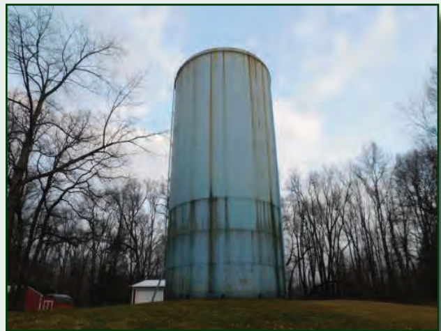
Photo shown above: Existing water storage in The Village of Lakemore, Ohio

The Village of Lakemore hired Hammontree & Associates to design a new water storage tank for the Village to replace an existing approximately 550,000 gallon potable water standpipe that currently serves the low-pressure zone within the Village. The current water storage standpipe has deteriorated over time and reached the end of its useful life.