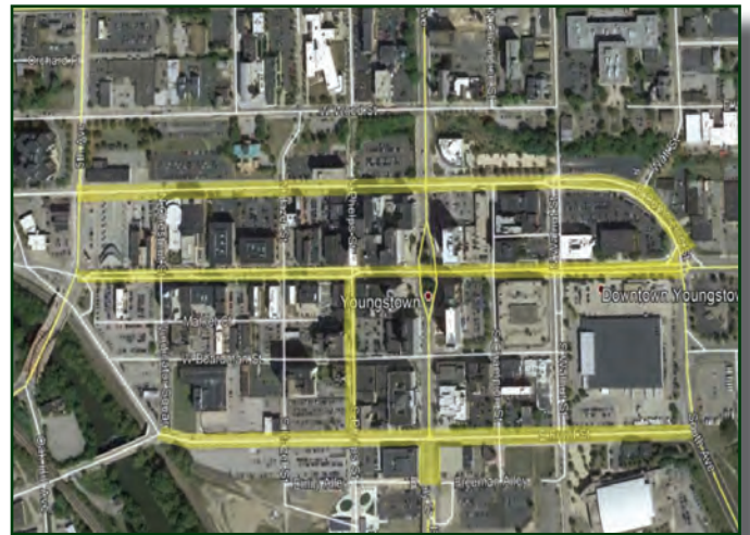
Aerial shown above: Aerial map of Youngstown, Ohio with project limits highlighted